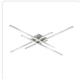
FM18247-BN Brushed Nickel