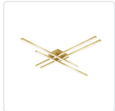
FM18247-BG Brushed Gold

Following the success of the Vega family is the next evolution of the line, Vega Minor. The diminutive square linear profile envelops and radiates a soft uniform light in a diverse spectrum of lengths and unique configurations. Refined details with crafted finishes augment the reductive silhouette of the expanded collection.